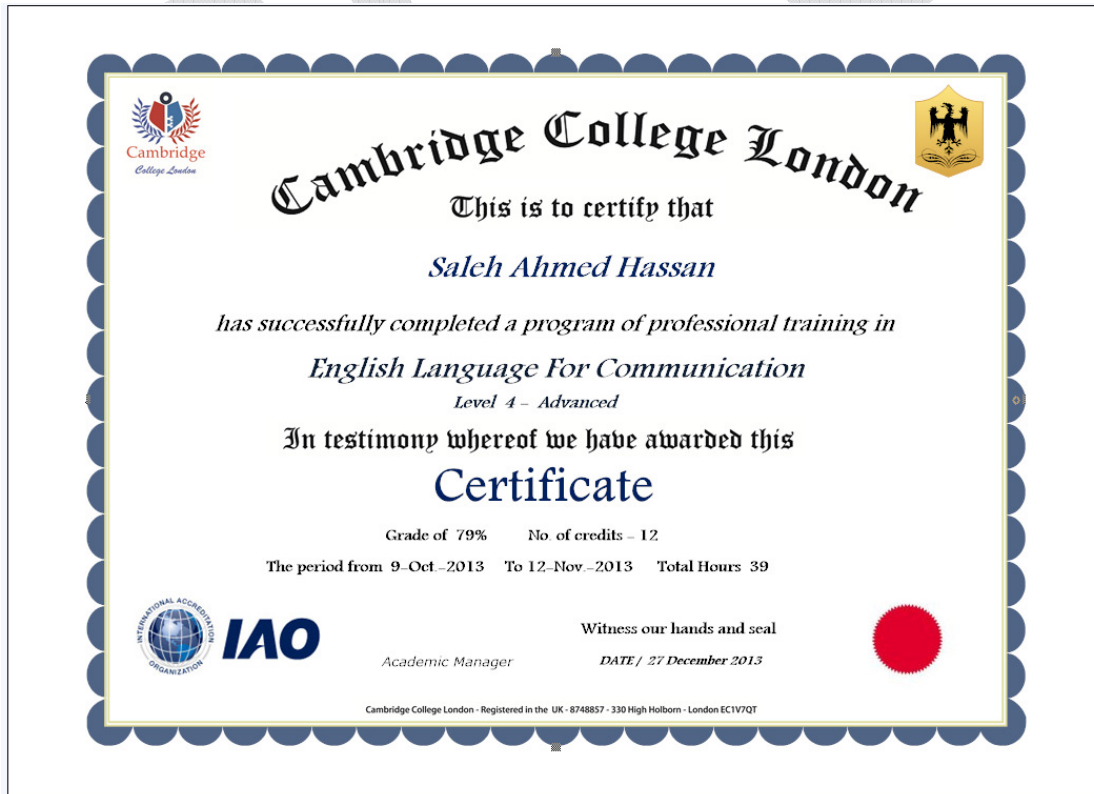
Sample Students Certificate

You will be provided with this series of books and their teaching materials to run your own classes ( Instructor Lead Training [ILT] ) and your students will receive their certificates from Cambridge College London.